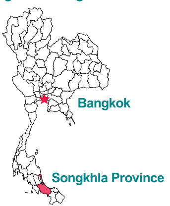
Figure 1. Songkhla Province

As part of the Division of AIDS Services' efforts to eliminate HIV-related stigma and discrimination (S&D) in healthcare settings throughout Thailand, in 2017 Songkhla Province was selected to implement S&D-reduction activities in two of its community hospitals—Chana and Satingpra. Applying lessons learned from this initial work, the province developed a coordinated strategy to scale up S&D-reduction activities in additional hospitals throughout the province, including its two large general hospitals