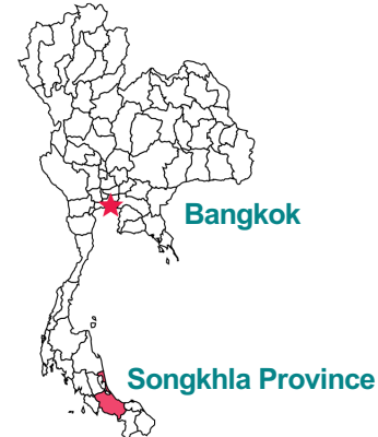
Figure 1. Songkhla Province

As part of the Division of AIDS Services' efforts to eliminate HIV-related stigma and discrimination (S&D) in healthcare settings throughout Thailand, in 2017 Songkhla Province was selected to implement S&D-reduction activities in two of its community hospitals—Chana and Satingpra. Applying lessons learned from this initial work, the province developed a coordinated strategy to scale up S&D-reduction activities in additional hospitals throughout the province, including its two large general hospitals